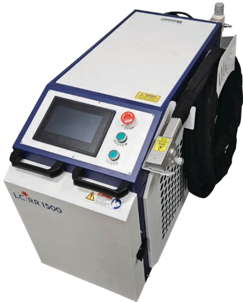
1500W laser in a portable package