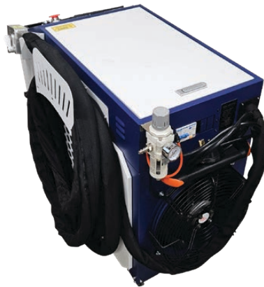
Ergonomically designed, handheld applicator