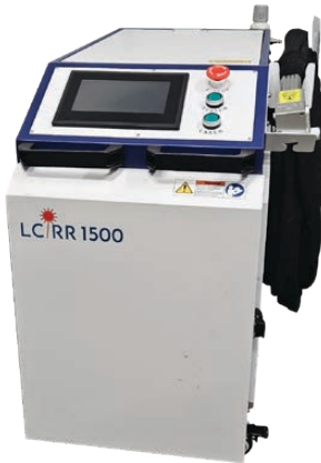
All-in-one with a touchscreen panel